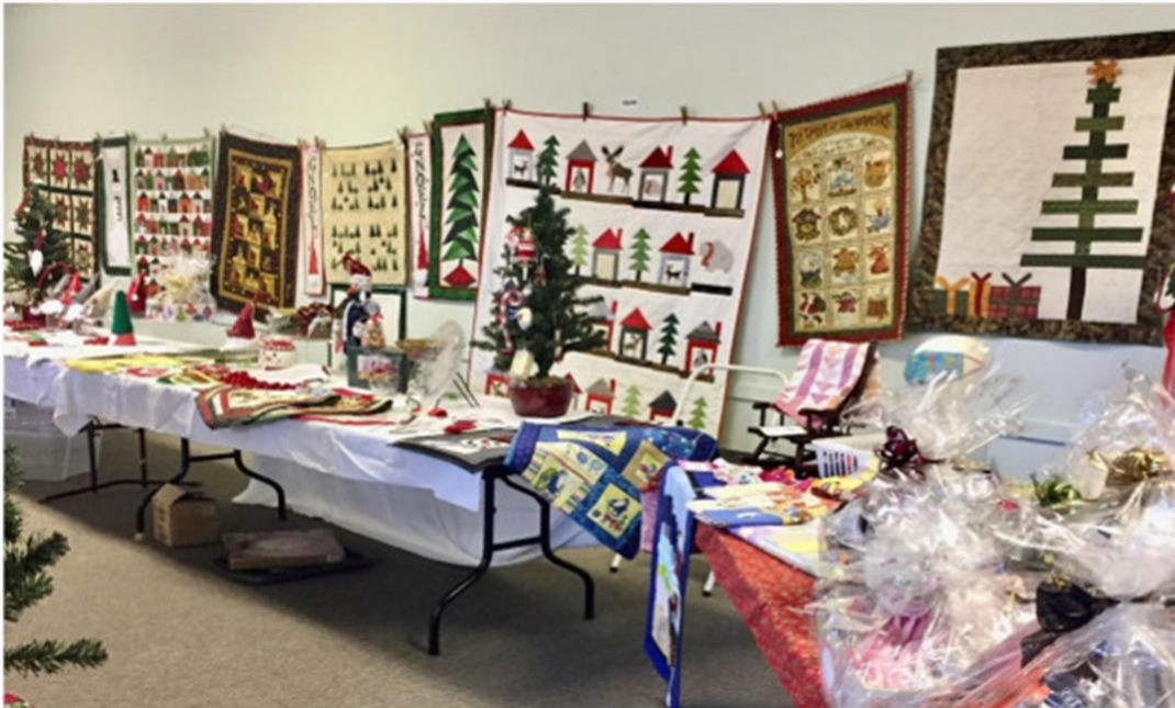
Fall 2022 Bazaar with Beautiful Handmade Textiles and Wrapped Gift Baskets

Proceeds include Calvary with monthly donations to the Clatsop County Food Bank, Helping Hands and Backpack program. Other donations include Harbor Shelter for abused women and children, Restoration House – male recovery program, Cannon Beach and Seaside American Legions, Baskets for Veterans, and monthly contingencies for our Parish Hall kitchen.