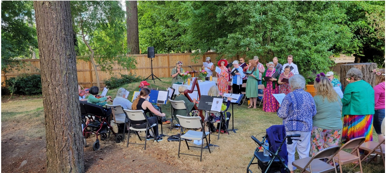
Choir and musicians 2022 Mass on the Grass.

added immeasurably to our worship services. As a result, congregational singing has significantly increased. Several members of the congregation also play instruments, adding to our musical worship. Other volunteer singers and instrumentalists are recruited externally to share their talents for special services. Plans are currently being developed to provide concerts for the community.