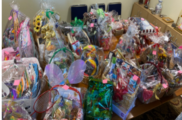
St. Aidan's Day Festival, 2022 Baskets for Fundraiser