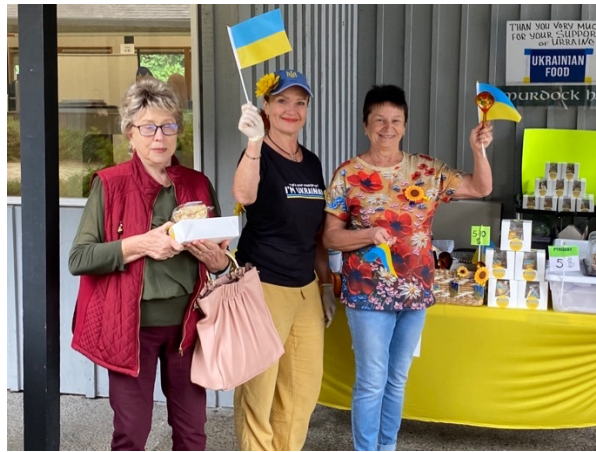
St. Aidan's Day, 2022, Eastside Day Care