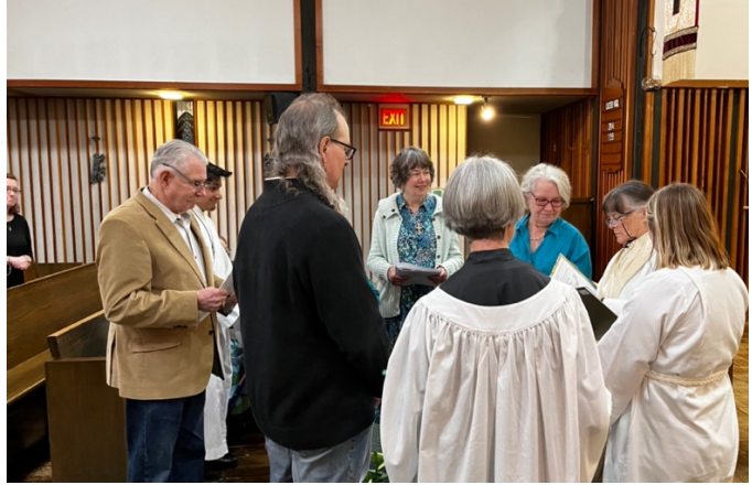
The Great Vigil, 2023 Adult Baptism