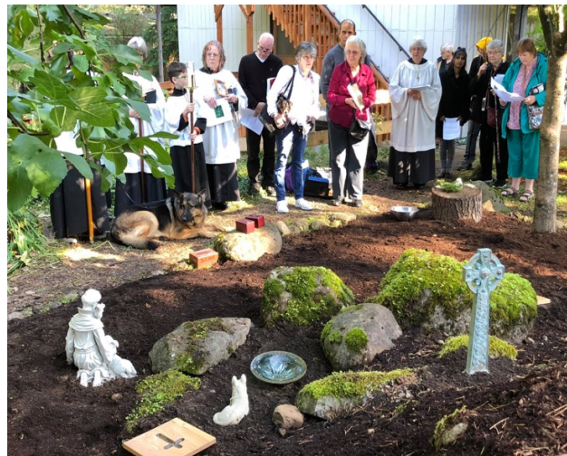
St. Francis' Day 2019 Prayers at Sophia's Garden