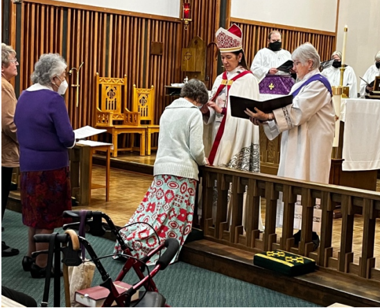
Bishop's Visitation, 2023 Confirmation and Reaffirmations