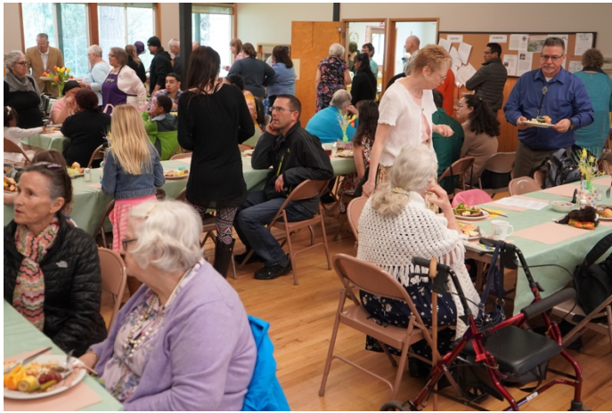
Coffee hour at St. Aidan's.

St. Aidan's is an unusually warm and welcoming community. Many in our congregation share stories of how they chose St. Aidan's as their church home. They remark on how genuine and accepting people are in engaging visitors. Our Sunday services are followed by a coffee hour hosted by