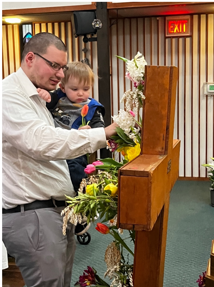
Easter Sunday, 2023 Flowering of the Cross