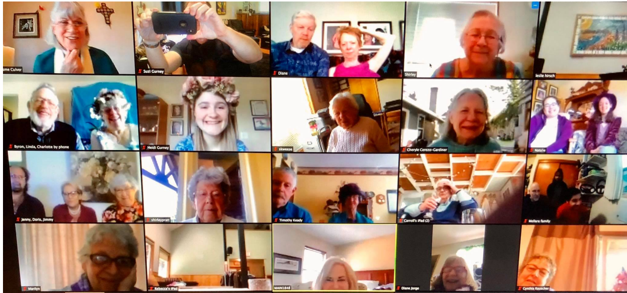
Easter Sunday, 2020 on Zoom

Lay leaders have also continued to provide weekly services and other regular activities since our previous rector's retirement. We regularly have Rite I Morning Prayer followed by adult Bible study. Vestry meetings and the weekly meetings of the Iona Book Club are conducted via Zoom. Until recently, we also had Rite II Evening Prayer and studied The Rule of St. Benedict via Zoom. Our hope is to resume Rite II Evening Prayer and the study of The Rule of St. Benedict in the future.