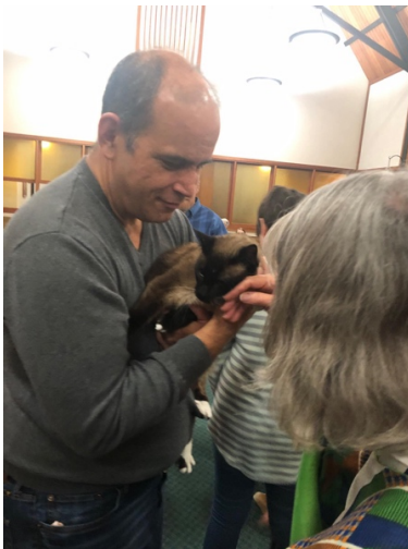
St. Francis' Day 2019 Blessing of the Animals