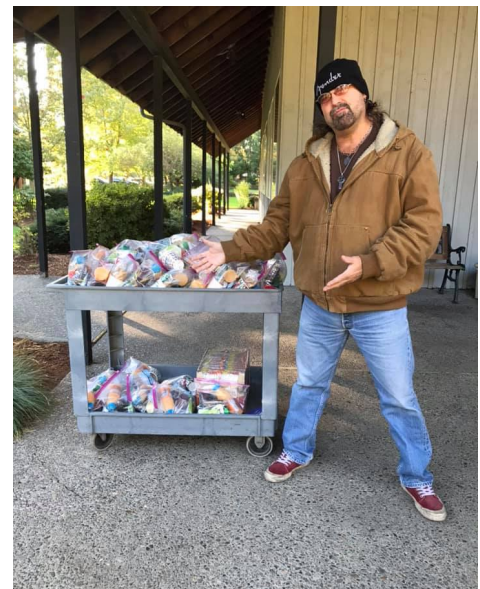
Sack lunches following our Sunday service.

After a brief time, three young people from our neighborhood joined in helping with food preparation and serving. We were also able to provide family food boxes as well as clothing and household goods for those in need. Although COVID required that we end this outreach, we have continued to provide food in the form of sack lunches on Sundays to visitors in need. We hope to resume a hot meal program soon.