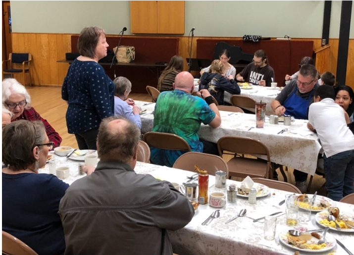
Community dinner 2019

and those who can troubleshoot electrical and plumbing systems complete minor repairs. When we purchased a second-hand Schlicker organ last year, the entire move and installation was made by volunteers requiring only one professional consultant. It is worth noting that all parish activities, except for the Director of Music and two part-time Sextons, are contributions of our members.