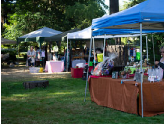
St. Aidan's Day Festival, 2019