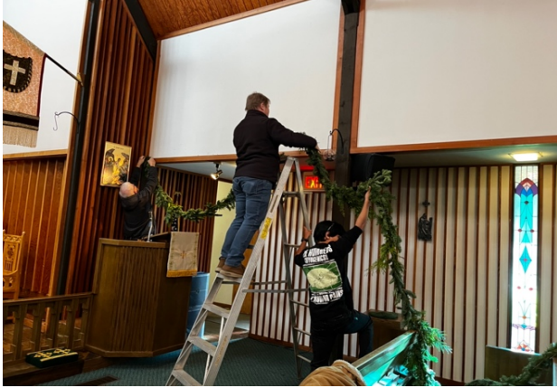
Advent IV/Christmas Eve 2022 Greening of the Church