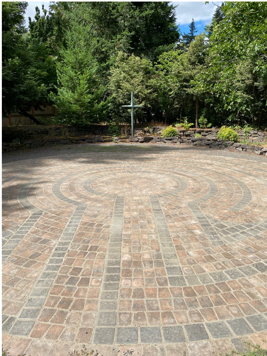
The Esme J.R. Culver Garden Labyrinth

Finally, a priest with a good sense of humor – including the ability to see the humor in one’s own foibles – will be most welcome. We are looking for a priest with respect and appreciation for the gifts of each person, a desire to learn from us, and a compassionate heart as we journey together into a shared future.