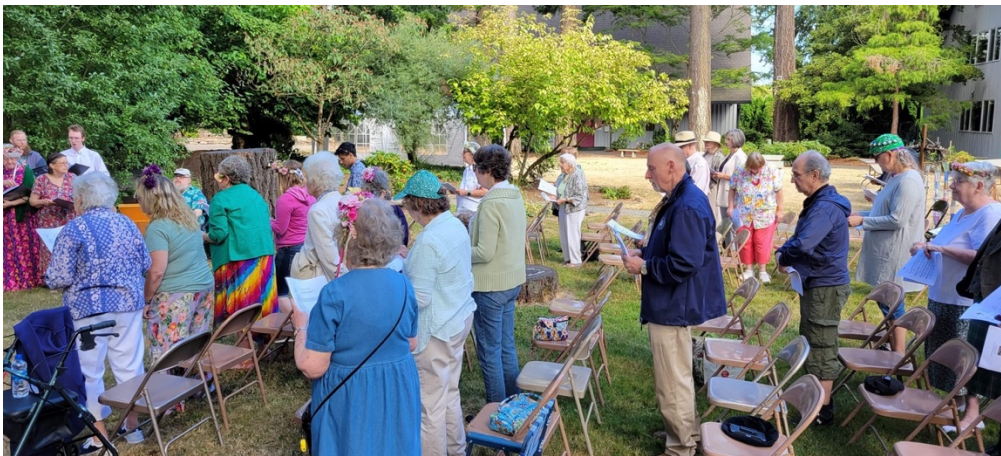
Mass on the Grass 2022

Plans for the church began in 1959. St. Aidan's became a full parish in 1967, eventually locating on our four acres of beautiful, wooded greenery. Since inception, St. Aidan's has prevailed through time as a spiritual home for generations of families and individuals from all walks of life. St. Aidan's committed congregation actively serves as